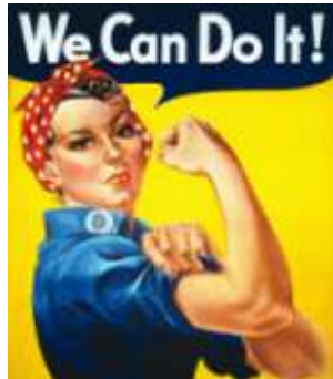
Right - Good