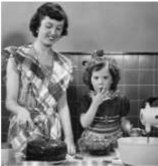
Wrong - Evil

The alternative he promoted was to at least have a career and at best abandon her family to find her own fulfillment in a world of "opportunity". He advanced formal education by promoting the idea that women were too stupid to raise the children God gave them. He then promoted the idea that women whose children had been removed to serve the state had nothing to do and were being exploited by husbands by being prevented from entering the workforce.